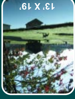
13' X 19' Log Cabin w/loft Features: Combination dinette/bed One double bed over one single bed in loft